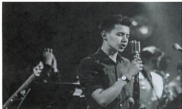
A selection of images from Jazz Nite