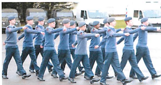
Pictured above: RAF Drill Team

Avid followers of CCF events may have noticed that at this time of year when the Contingent would normally be entering a team for the Combat Cadet Competition held by 7 Brigade we don't have an entry. Although a bid was entered for the competition King's was not selected to participate as there were too many applications and not enough team places available. We will try again next year.