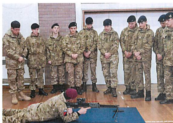
Pictured below: LSW Training