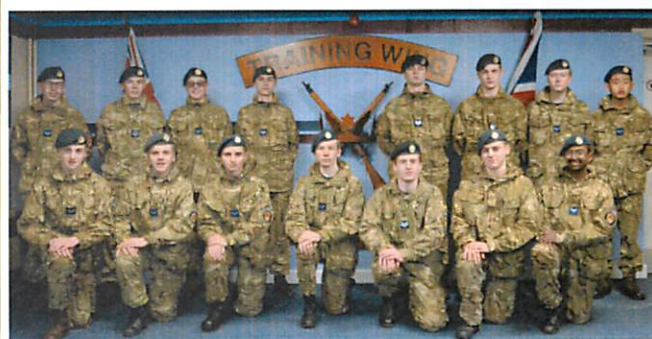
The RAF Competition Team