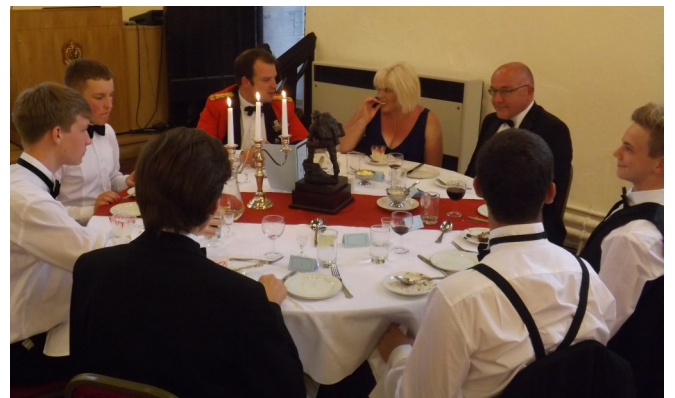
More guests at dinner