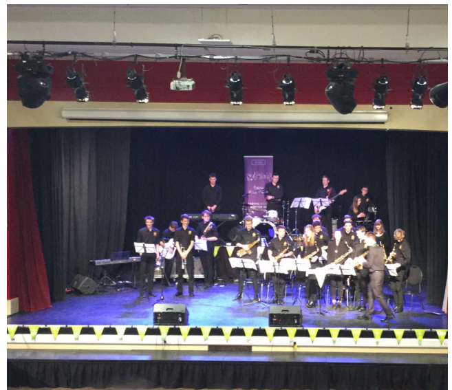
Images from the National Music for Youth Festival